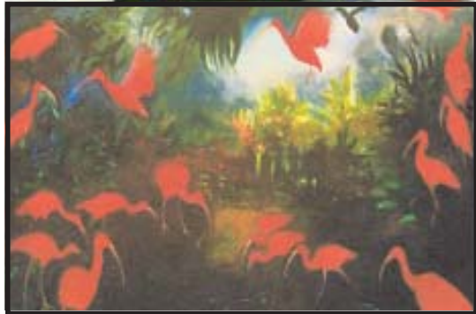
Scarlet Ibises by Rhea Edge

Few things are as valuable as those we carry in minds and hearts as shared experience. The artist, while developing technique and a visual language, strives to communicate some of life's more profound ones. The scope of this expression can be broad, from the most cruelly disturbing moments to those of pure bliss and the celebratory exuberance of the joy of life. They include the most flamboyant and bombastic, the quiet, the poignant, the hidden, or that which may be deeply felt and seldom expressed.